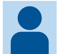
Vacant District #6 Director